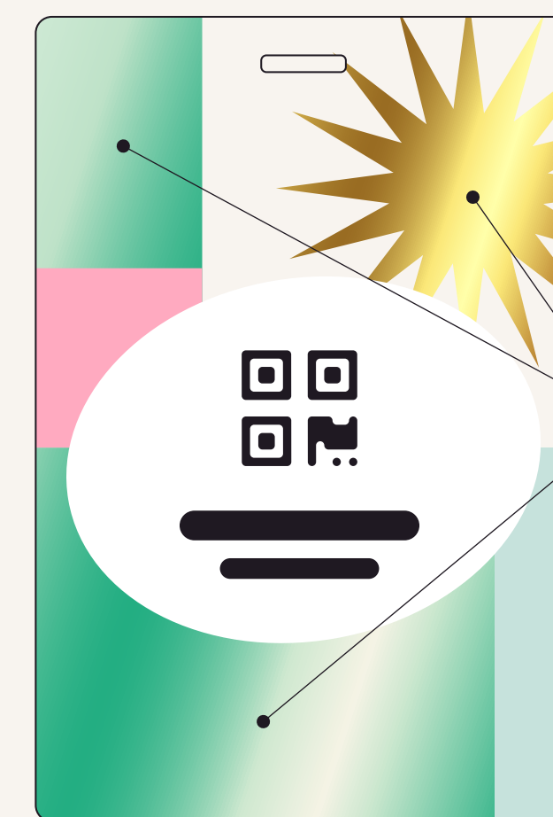
Metallic Ink Result

Avoid areas where you plan to thermal print